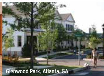
Glenwood Park, Atlanta, GA