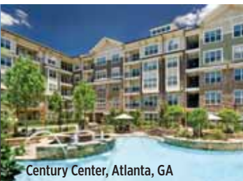
Century Center, Atlanta, GA