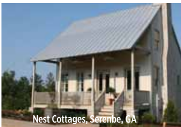
Nest Cottages, Serenbe, GA

The EarthCraft program takes a practical approach to constructing environmentally responsible projects, making them accessible to a variety of market sectors, including affordable housing. EarthCraft homes deliver energy and water savings, healthier indoor air quality and reduced maintenance and utility costs – attributes that are critical to lower income residents. Through its affordable housing work, EarthCraft ensures the benefits of green building reach those who need them the most. Since its inception, EarthCraft has dispelled the myth that “green costs too much.” In recent years, EarthCraft has been incorporated into the state Qualified Allocation Plans in both Georgia and Virginia. Through these programs, affordable housing developers are able to access additional tax credits that drive down the cost of EarthCraft housing even further.